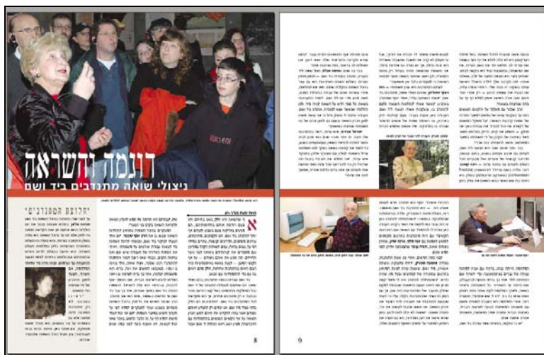
View full-text or full-image, if available.

A project of Tel-Hai College Library in Upper Galilee, where indexing was produced and then input by the University of Haifa. Newspapers captured: Ha'aretz , Hatsofeh , Al-Hamishmar , Davar , Ma'ariv , Yediot Aharonot and Hadashot (until its closing). Particular emphasis given to longer, analytical articles on social, economic, and political topics (including "op-ed" articles) as well as significant reviews of books, exhibitions, theater, and other cultural events. THIHN contains 188,500 newspaper articles from January 1985 to April 1992, and from April 1994 to February 1997.