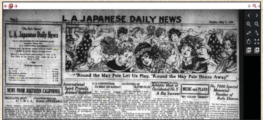
An early edition in English