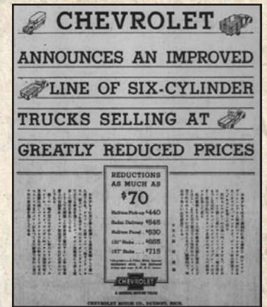
Advertisement from 1933