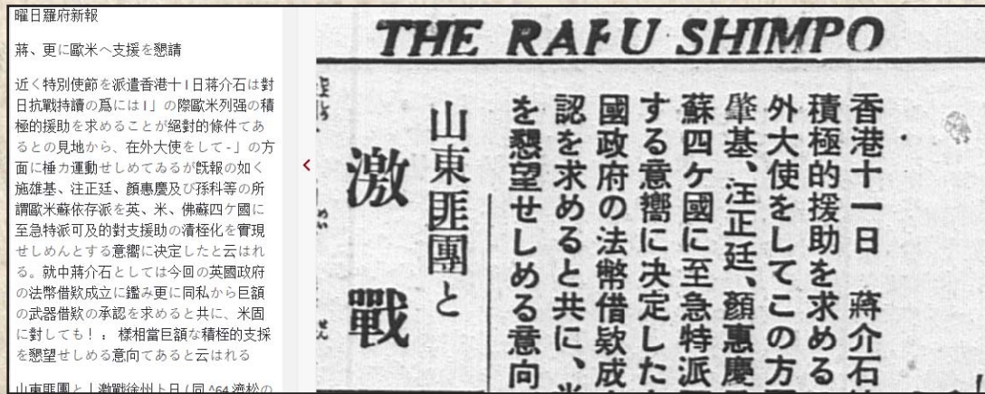
Text and full-image shown side-by-side on East View's Global Press Archive platform