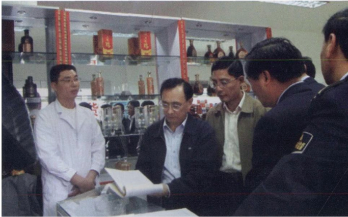
From CRG's China Yearbooks: Cai Qi and other Shanghai leaders visit Zhuanghang Village in Fengxian District, Shanghai. Fengxian Yearbook, 2008.

studies of Communist Party capabilities, network analyses, and evaluations of public image management on popular media platforms. CRG also contains numerous references to Ding Xuexiang, including over 1,400 journal articles, over 300 Theses and Dissertations, and over 600 newspaper articles. According to metadata in CRG, over 400 of these publications are tagged as pertaining to Xi Jinping, who brought Ding Xuexiang along with him to Beijing in 2012.