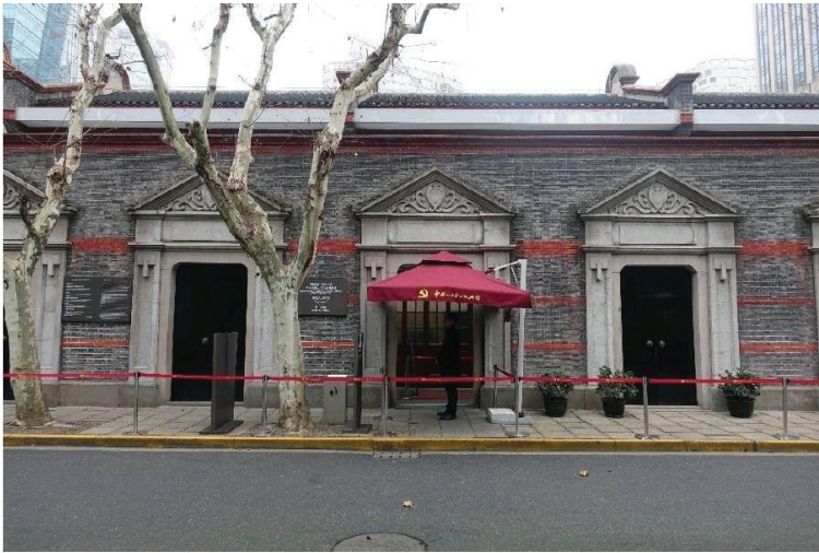
图 6-12 中国共产党第一次全国代表大会会址

From CRG's China Doctoral Dissertations: the location of the first Communist Party Congress in 1921. Dai Tianchen, "Space Narrative," 2019.