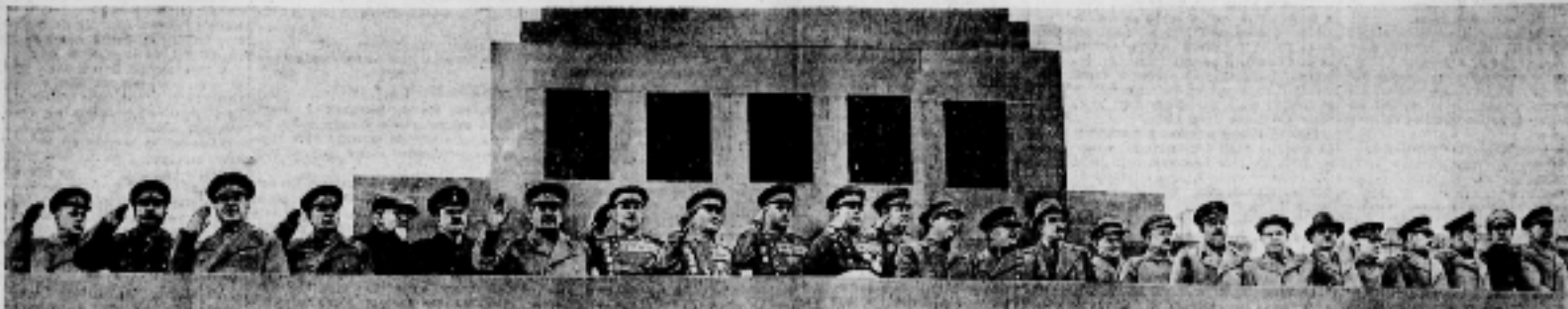
Screen shot from UDB-Pravda Digital Archive

Советский народ славит воинов доблестной Красной Армии, армии-победительницы, славит творца победы великого Сталина.