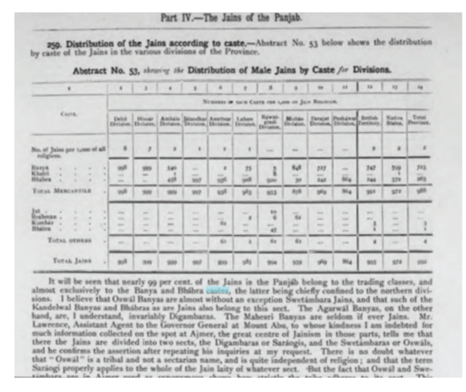
"Page 155." India, 1881. Panjáb Report v01, 1883, gca.eastview.com/CENSUS-2544814B0.1.155.