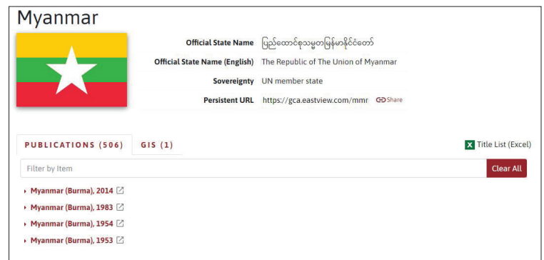
Myanmar Country Landing page on the Global Census Archive platform.

The United States is hardly the only country using census data as an essential tool to guide its elections. The Indian Constitution, for example, also mandates regular population censuses, which enable the Parliament to redraw electoral boundaries based on population changes. In many countries such as Argentina, Chile, Hungary, Israel, and the Netherlands, government records such as census counts are used for automatic voter registration.