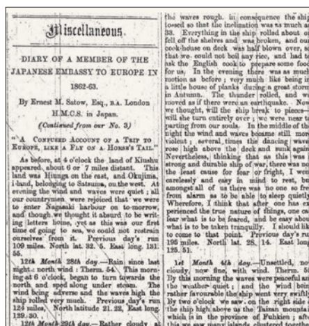
Abstracts of records of a Japanese delegation to Europe, translated by Ernest Satow, published in the Sept. 29, 1865 issue.

and buy the paper if articles were written in a certain way, with such a discovery leading to the creation of journalists.