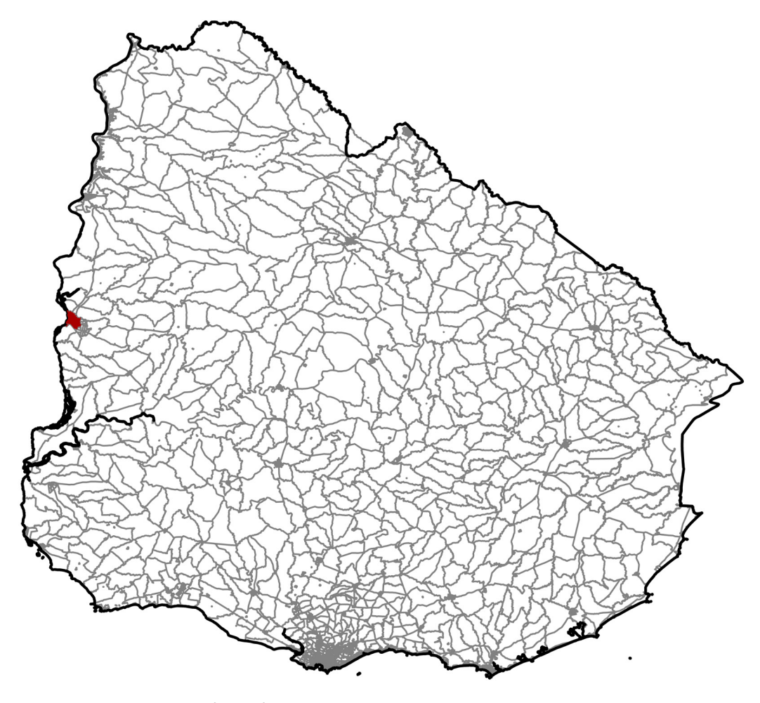
ADM 3/0 boundaries for all of Uruguay; area in red, over Paysandú, available as sample data